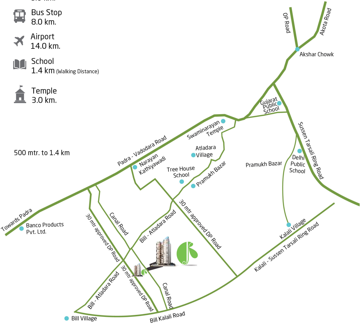
Map is representative only and may not be accurate

Terms & conditions: While every reasonable care has been taken in preparing this brochure, the developers cannot be held responsible for any inaccuracy in its contents. | All plans, images, illustrations, information and specifications are subject to change and do not form part of any offer, contract or agreement. | Electricity Connection, Legal, Stamp Duty, Registration, Water Connection, Maintenance and Development charges shall be extra.